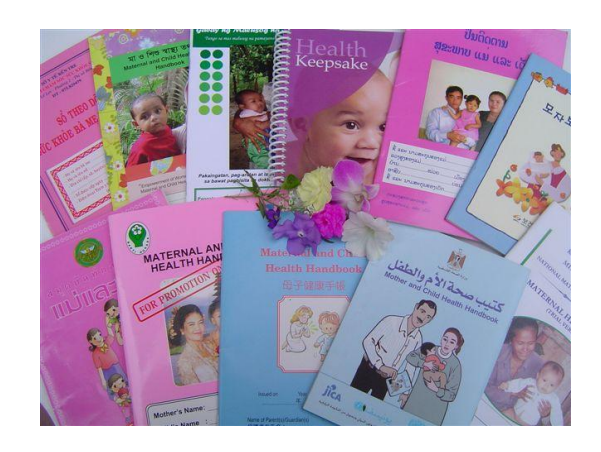
Cover pages of selected MCH handbooks in the world

The purpose of MCH handbook is to incorporate information that ranges from primary health care to specific issues of reproductive health, pregnancy and child care; acts as a motivational tool for health care providers and pregnant mothers' family to assist and encourage to empowerment of pregnant mothers to seek medical care, where and how, when needed; provides with home base medical records, referral documents of pre and post natal mother and child health care services to assures the continuum of care.