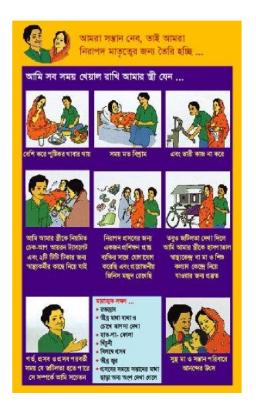
Selected content pages from Bangladesh MCH handbook '08: Birth Planning