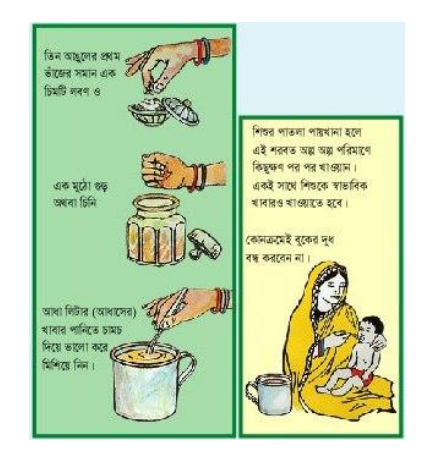
Oral dehydration solution (ORS) preparation instruction for diarrohea treatment at home